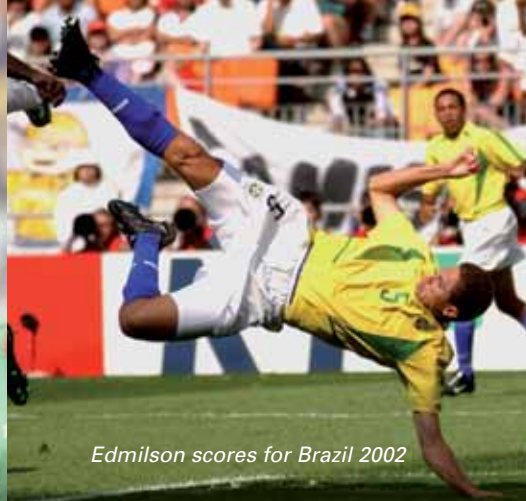
Edmilson scores for Brazil 2002

"In 2002, I had the opportunity to win the World Cup and without a doubt, it was a special moment. It was a time when I could see the hand of God every day. I believe that it was God who kept me on the Brazilian National Team and has kept me involved in great competitions. We won, and once again had the opportunity to thank God for the whole world to see." Lucio (2002)